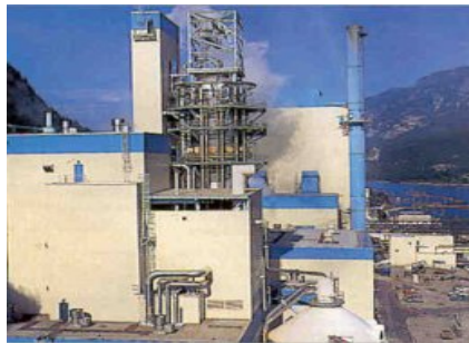
Celgar Pulp Limited